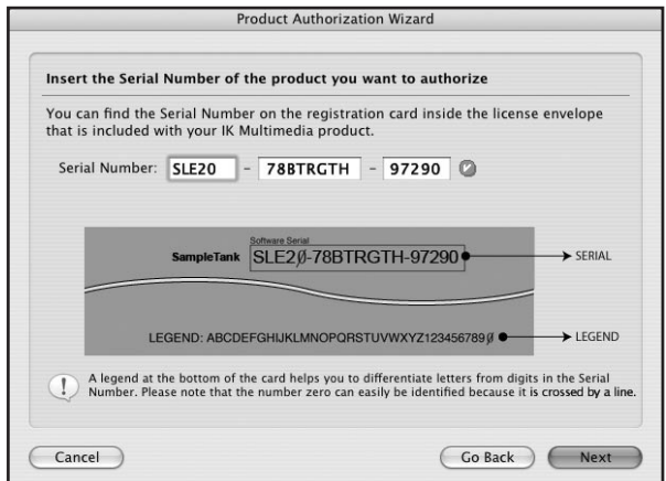
Step 2. Enter Serial Number

The next Step ( Step 2. Enter Serial Number ) is for inserting the Serial Number. The Serial Number is written on the Registration Card (included with your IK boxed product, inside the license envelope) or the one that has been delivered to you (e.g. Online purchase, such as a Digital Delivery, or update). Type the Serial Number in the fields (using the TAB key to move from one field to the other). Once the Serial Number has been