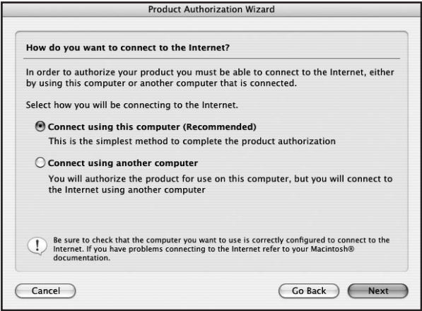
Step 4. Connect to the Internet

In order to obtain the Authorization Code you'll need to go online using an internet connection. In this window, ( Step 4. Connect to Internet )