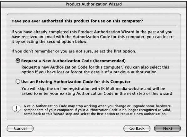
Step 3. Authorization/Reauthorization

properly inserted a green icon will display, showing that the number has been entered correctly. If a red icon is displayed the Serial Number inserted is not correct and you will be asked to re-type it in the fields. Once the Serial Number has been typed correctly, the Next button will enable you to move to the next Step of the Wizard.