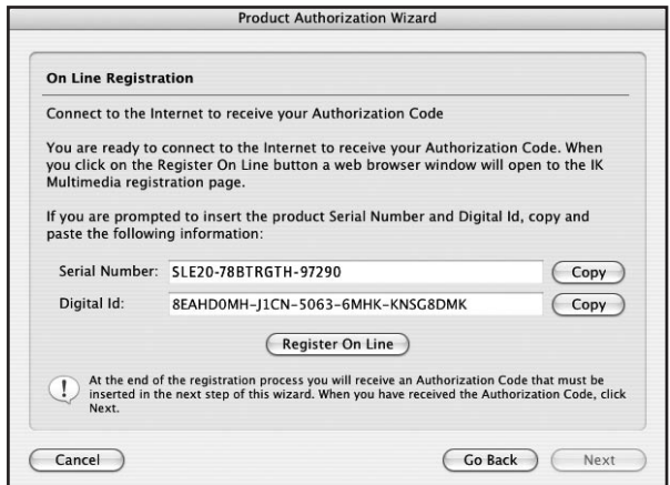
Step 6a. Online registration on the same computer

In this page of the Wizard ( Step 5. User Name and Password ) you should type your IK Multimedia User Name and Password. If you have already registered any other IK Multimedia product you should use the same User Name and Password that you used previously to access the IK Multimedia User Area (where you can download updates and upgrades, requests new authorizations, manage your registration data, etc...). If you have never registered any other IK Multimedia product or if you can't remember your previous registration information click on the second option. Once you are done click Next.