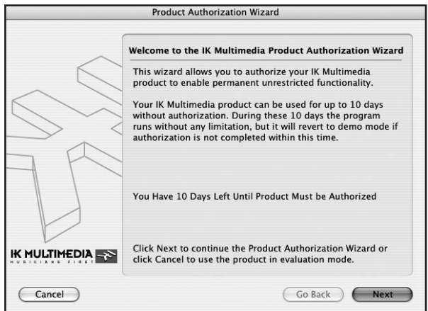
Step 1. Wizard introduction

A built in software Wizard helps you in the authorization of your IK software. The first time the software is launched the Wizard is displayed ( Step 1. Wizard Introduction ). Click Cancel to return to the software and use the software within the 10 days grace period. Click Next to go to the Wizard's next Step and authorize the software.