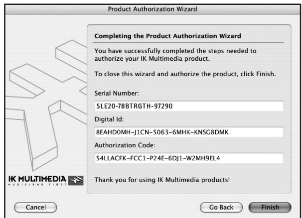
Step 8. Authorization Completed

Once the green icon is displayed, click Next and the last page of the Wizard will appear ( Step 8. Authorization Completed ) listing your Serial Number, Digital ID and Authorization Code as a reference. Click Finish to start using your IK Multimedia product with unrestricted functionality.