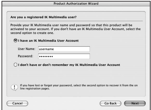
Step 5. User Name and Password

you are asked if you will connect to the internet using your current computer or a separate one. Make your choice and click on the Next button (if you connect to the internet using a different computer you'll proceed directly to Step 6).