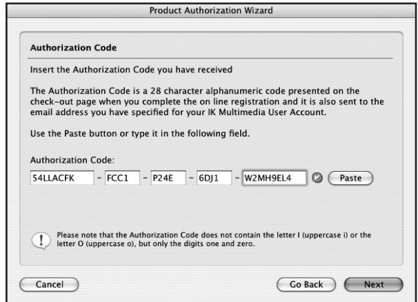
Step 7. Paste Authorization Code

in the first field of the Authorization Code in the Wizard and click on the Paste button. All the separated fields will be filled and a green icon will display, showing the Authorization Code has been entered correctly. If a red icon is displayed, the Serial Number inserted is not correct and you will be asked to re-type it in the fields (if you typed it manually).